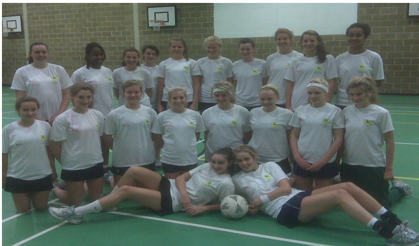
2009 / 2010 Surrey County Academy members

A full list of squad members can be found on the netball pages of the Active Surrey website: www.activesurrey.com .