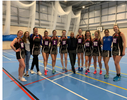
Teddington Swans, winners of the County League 2018/19

1 st Teddington Swans 2 nd Capital Nuns 3 rd Cobham 4 th Alpha